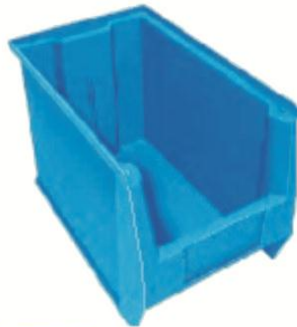
BULL BIN 45