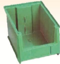
BULL BIN 35