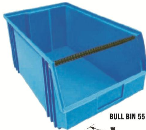
BULL BIN 55