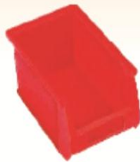
BULL BIN 15