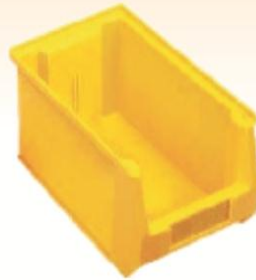
BULL BIN 25